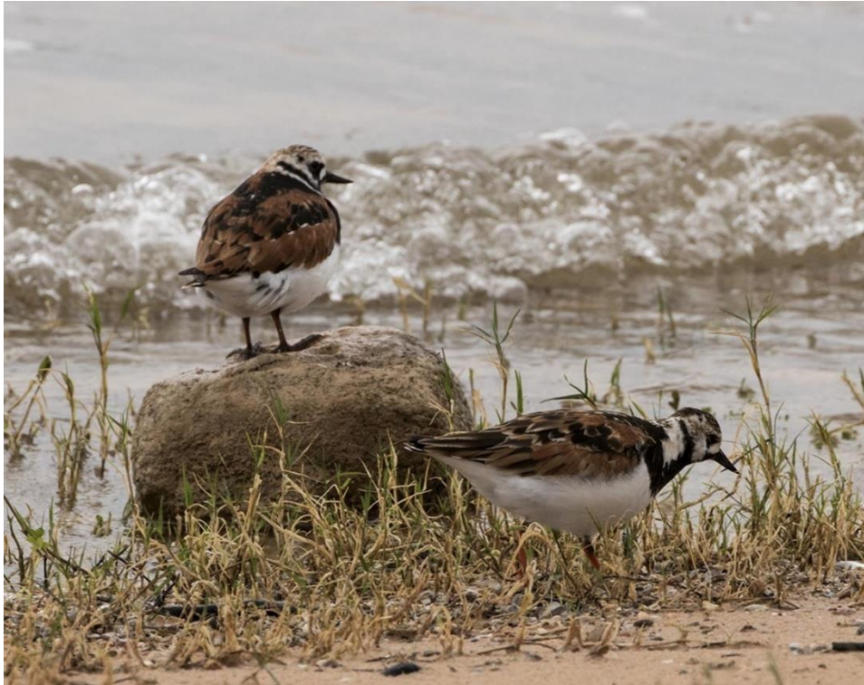
Ruddy Turnstone, 16 May 2020, Bell County