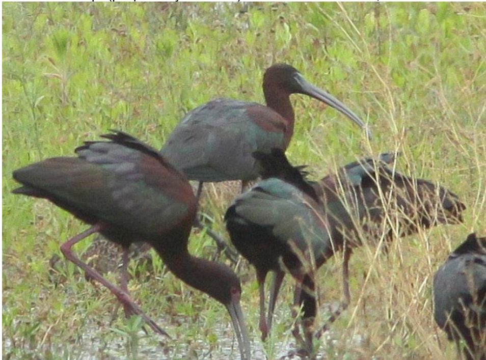
Glossy Ibis, 28 Apr 2020, Bell County