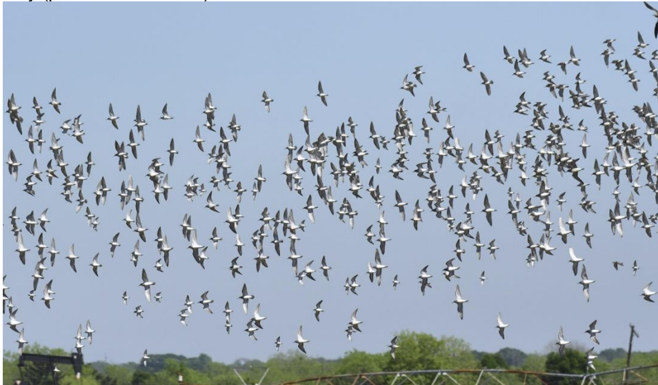
Pectoral Sandpipers in mixed flock, © Simon Kiacz, 25 Mar 2020, Brazos County

Pectoral Sandpiper – Pectoral Sandpipers visited Sims Lane, Brazos 5 Mar–18 May (m.ob.), including a high count of 1100-1200 on 25 Mar–5 Apr (ph. Simon Kiacz, Michael McCloy). A high count for Bastrop at Old Potato Road was one flock of at least 100 with more too far out on the turf farms to identify on 13 May (ph. Jason Leifester).