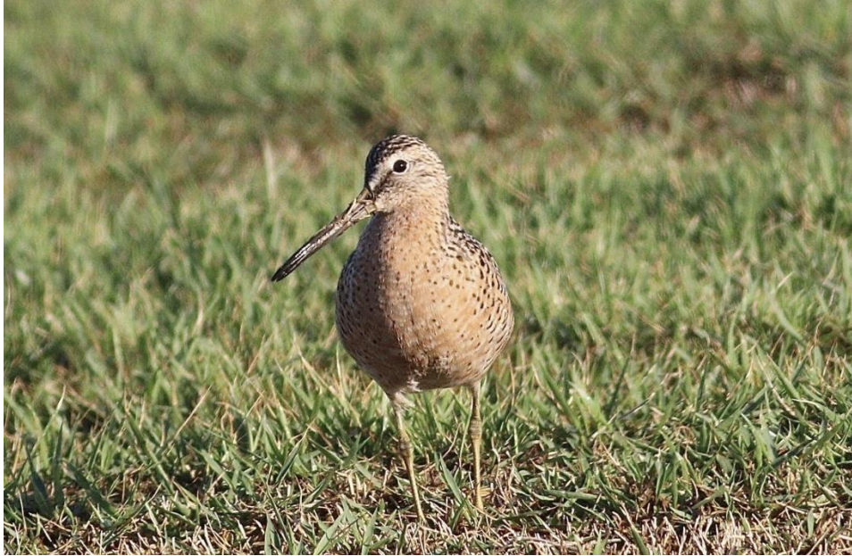
Short-billed Dowitcher, 17 May 2020, Brazos County