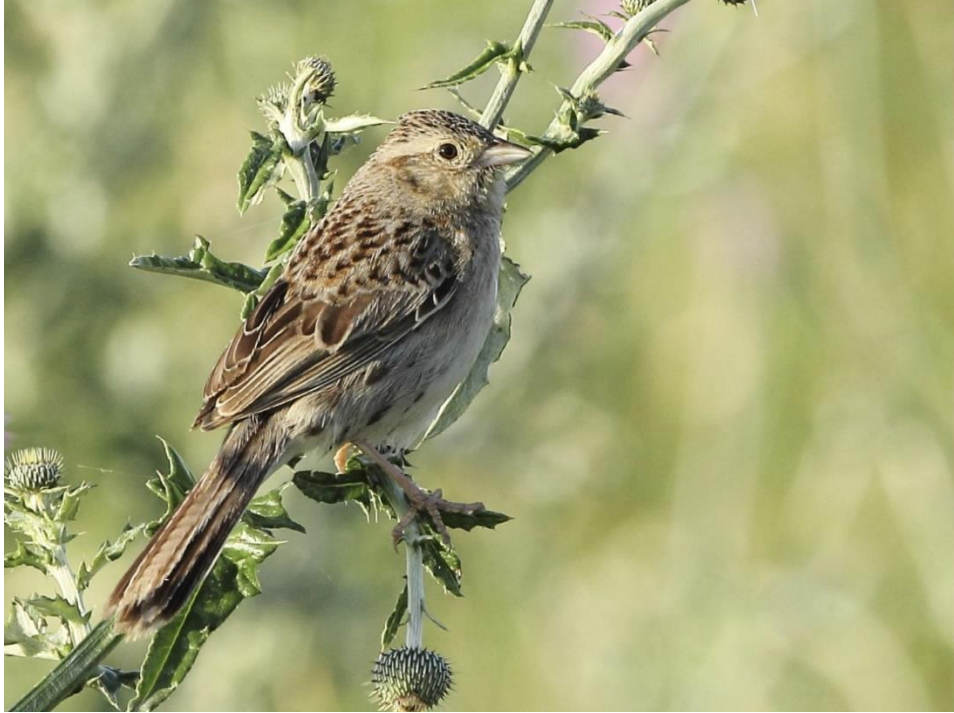
Cassin's Sparrow, 3 May 2020, Bastrop County

Cassin's Sparrow – Occasional in Bastrop , this spring Cassin's Sparrows were reported nearly a dozen times at Gotier Trace Road and Sayersville Road 25 Apr–25 May (ph. Jason Leifester, m.ob.).