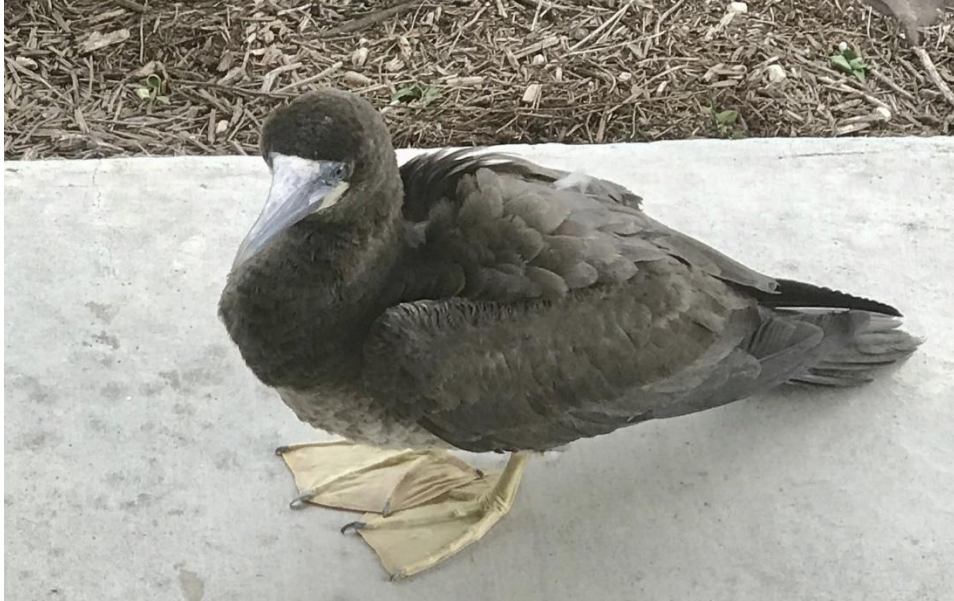
Brown Booby –, 18 Mar 2020, Milam County

Brown Booby – Unbelievably but for photos, an immature Brown Booby was found sleeping on the back porch of a residence in Cameron, Milam 18 Mar. Not surprisingly, it is a first record for Milam.