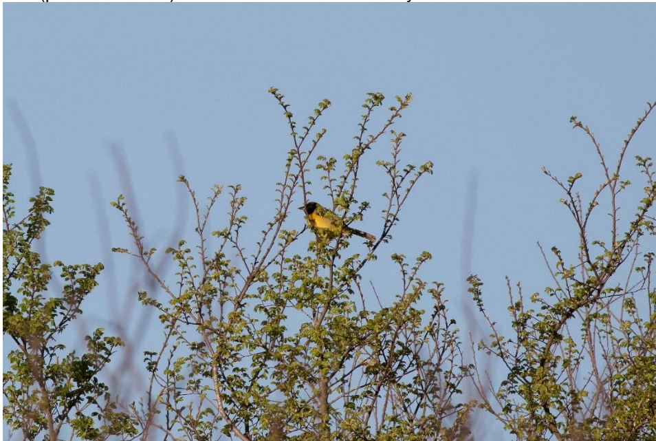
Audubon's Oriole, 5 Mar 2020, Bastrop County

Audubon's Oriole – The rare Audubon's Oriole that first appeared 16 Feb in Bastrop was last seen 5 Mar near the intersection of Dairy and Earl Callahan Roads.