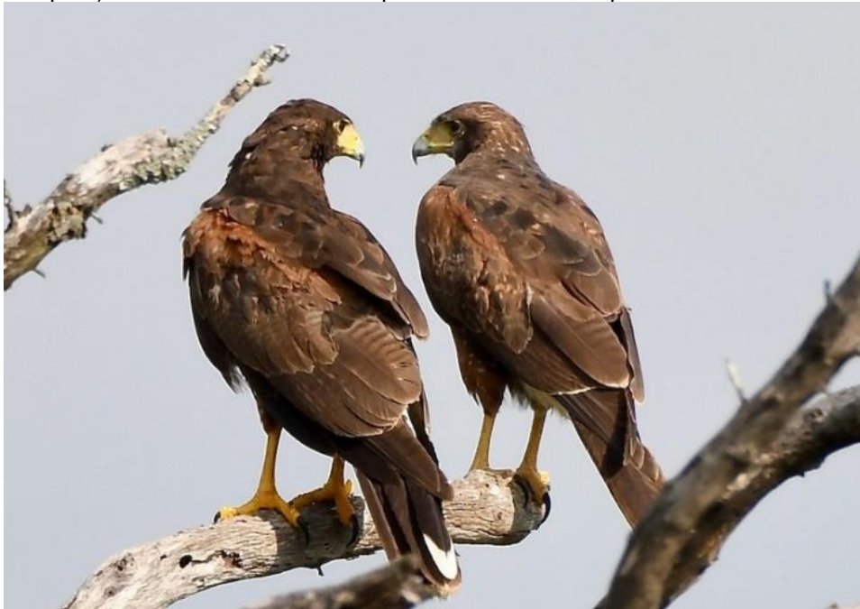
Harris's Hawk –, 22 May 2020, Bell County