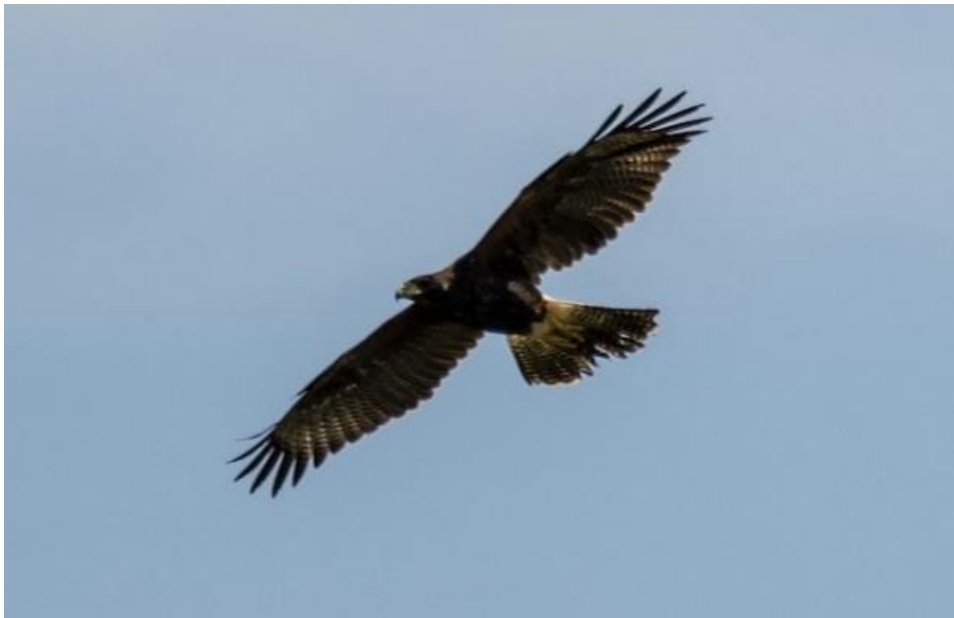
Golden Eagle, 27 Apr 2020, Lee County