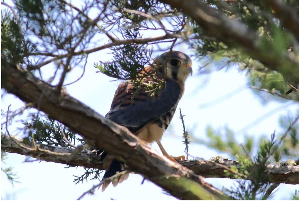
American Kestrel fledgling, 19 May 2020, Brazos County