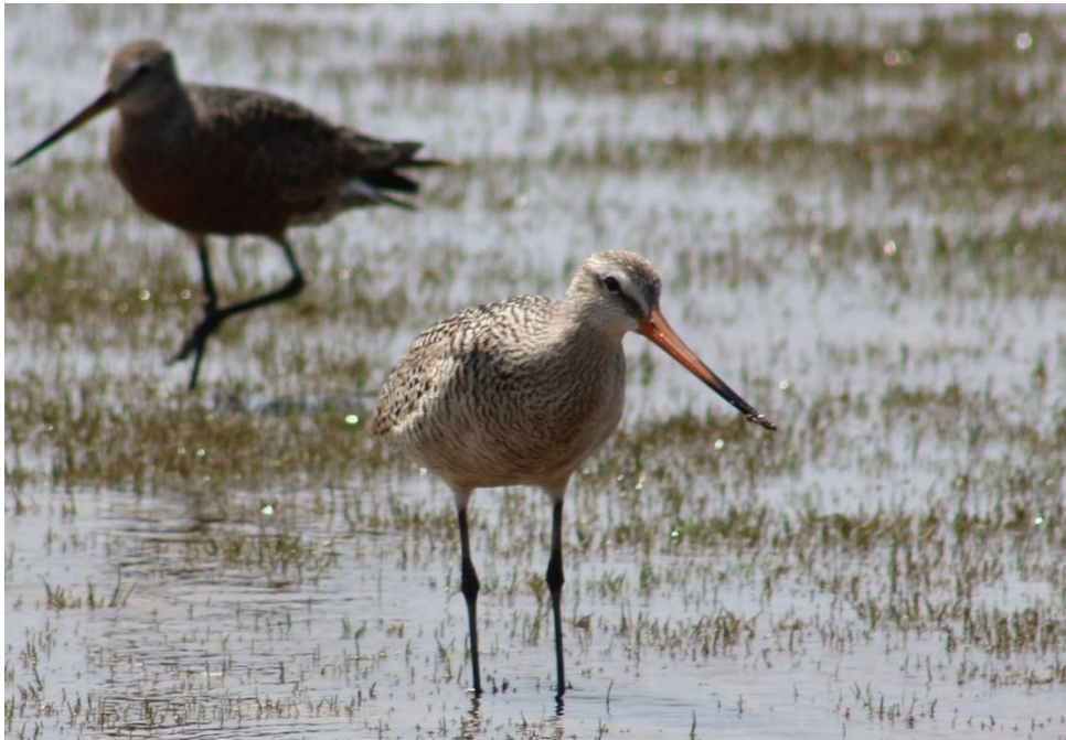
Marbled Godwit, 17 May 2020, Brazos County