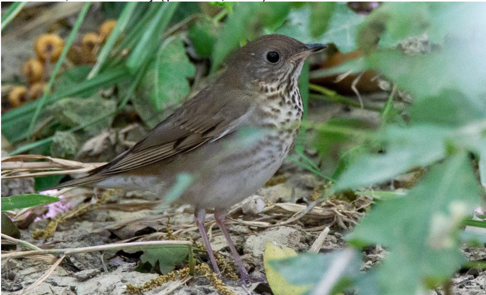
Gray-cheeked Thrush, © Scott Snyder, 10 May 2020, Bell County

Gray-cheeked Thrush – A scarce and long-staying Gray-cheeked Thrush was viewed often at Temple Lions Park, Bell 2-17 May (†Jeff Hall, m.ob.).