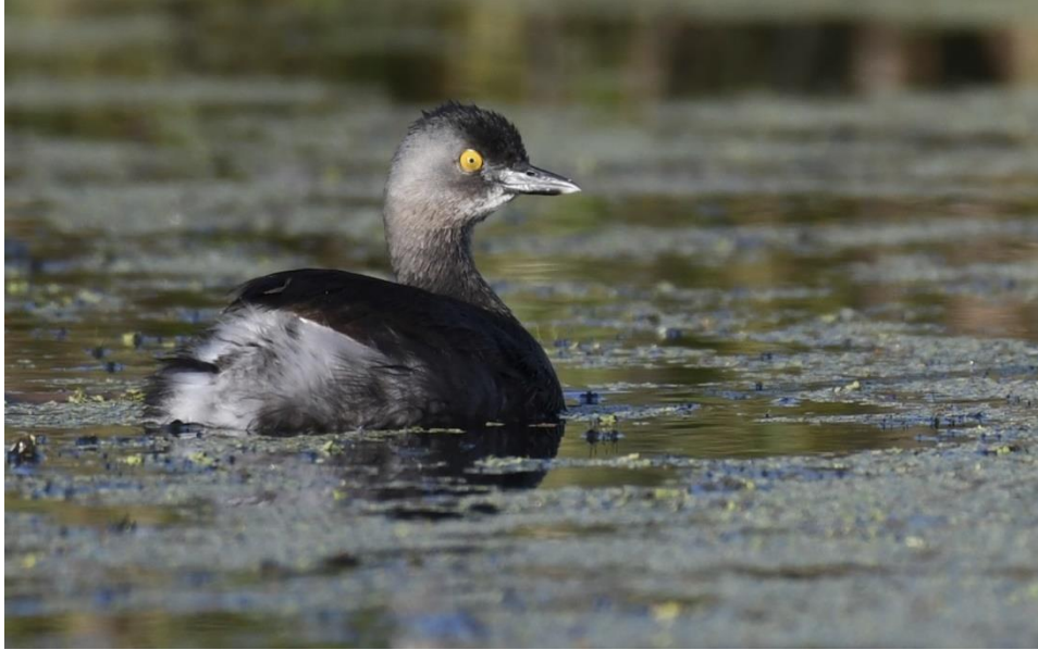
Least Grebe, 25 Apr 2020, Brazos County