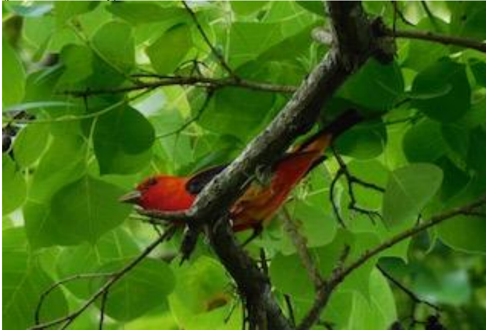
Scarlet Tanager, 3 May 2020, Brazos County

Scarlet Tanager – An excellent find for Brazos, a young male Scarlet Tanager was at Brison park 3 May.