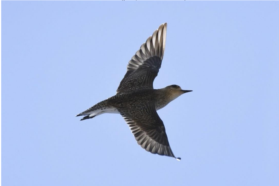
American Golden-Plover, 25 Mar 2020, Brazos County