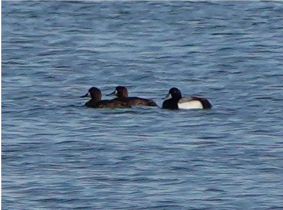
Greater Scaup, 28 May 2020, Brazos County