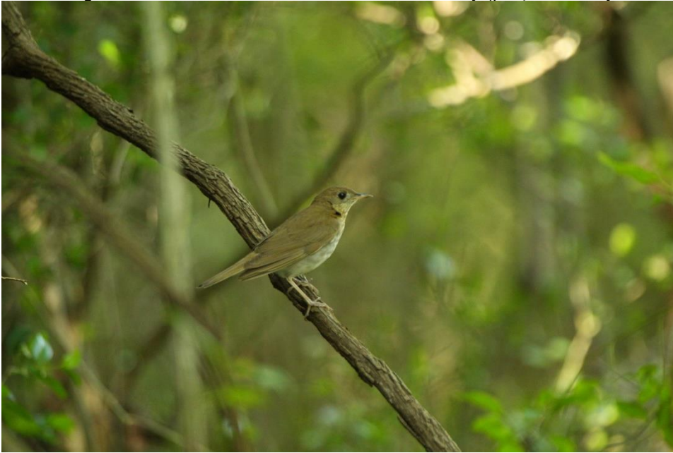
Veery, 11 May 2020, Washington County