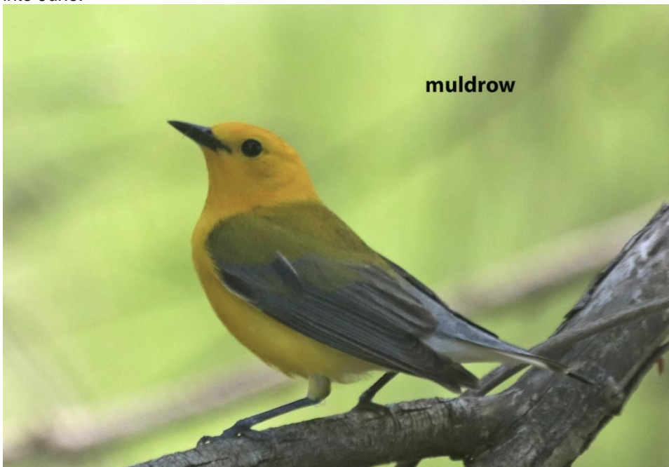
Prothonotary Warbler, 25 Apr 2020, McLennan County