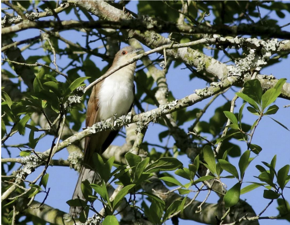
Black-billed Cuckoo, 30 Apr 2020, Brazos County