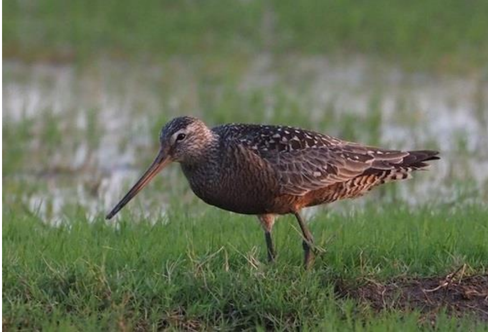
Hudsonian Godwit, 20 May 2020, Brazos County