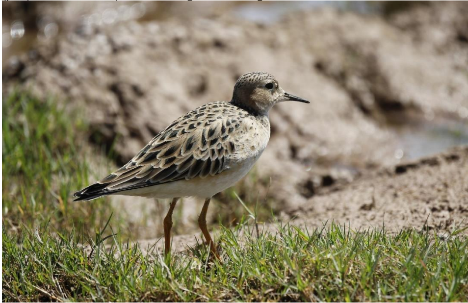
Buff-breasted Sandpiper, 19 Apr 2020, Brazos County