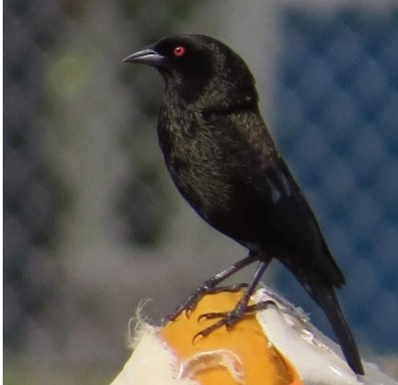
Bronzed Cowbird, 23 May 2020, Bastrop County