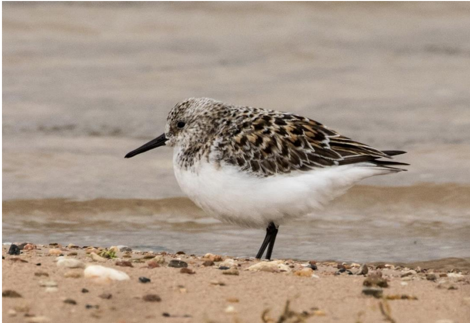
Sanderling, 16 May 2020, Bell County