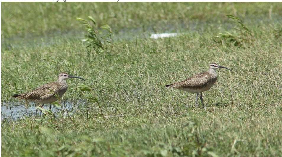
Whimbrel, 29 Apr 2020, Bell County