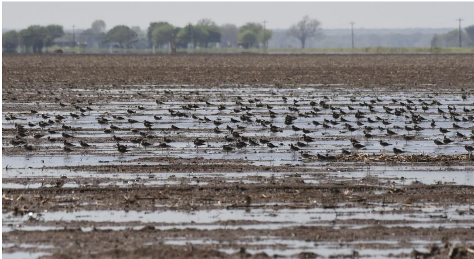
American Golden-Plover, 25 Mar 2020, Brazos County