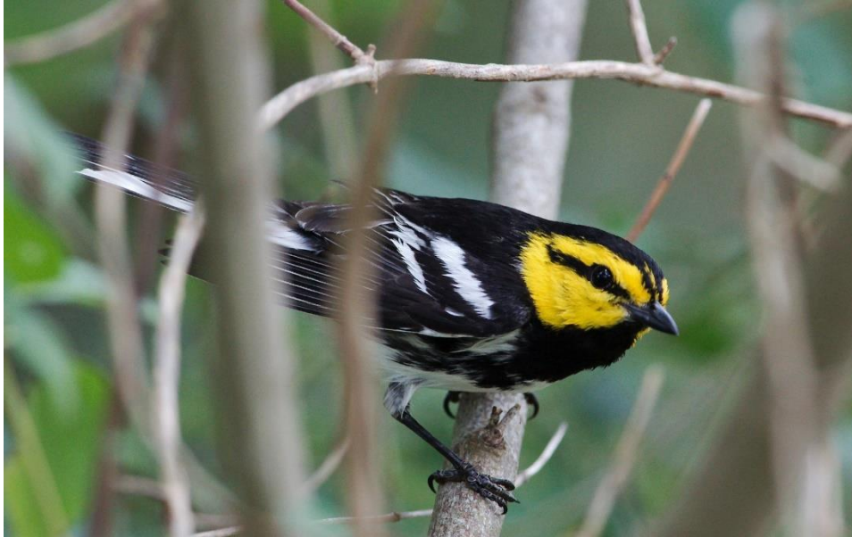
Golden-cheeked Warbler, © Gil Eckrich, 31 May 2020, Bell County

Golden-cheeked Warbler – Not rare in Bell , but the photograph was too good to pass up, taken at Stillhouse Park, Stillhouse Hollow Lake 31 May (ph. Gil Eckrich).