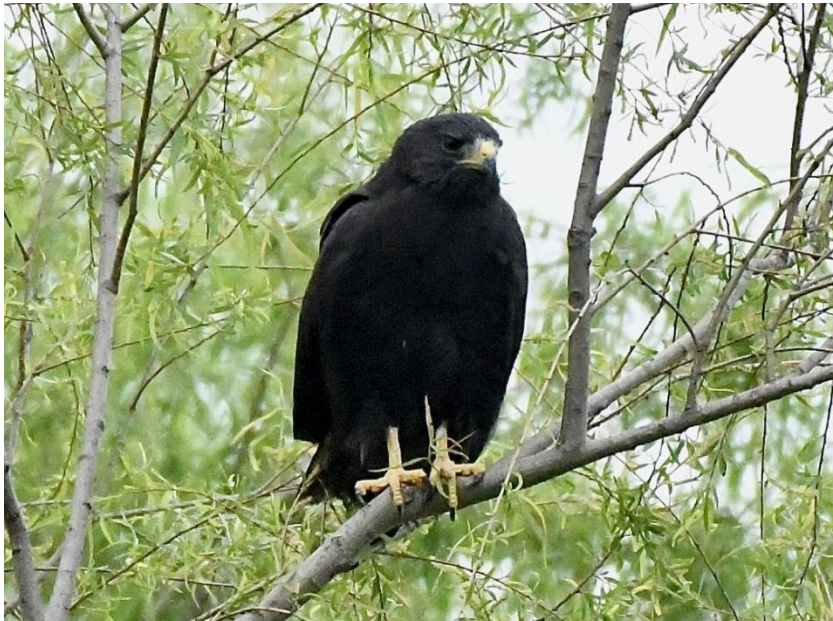
Zone-tailed Hawk –, 20 Apr 2020, Bell County