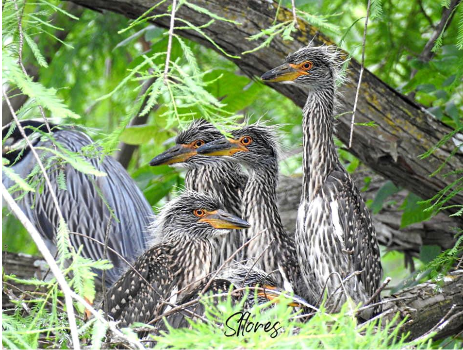
Yellow-crowned Night-Heron, © Smily Flores, 26 May 2020, Brazos County

White Ibis – A dozen White Ibis 16 Apr (†Kelly Sampeck) near Navasota provided only the 3 rd spring record for Grimes .