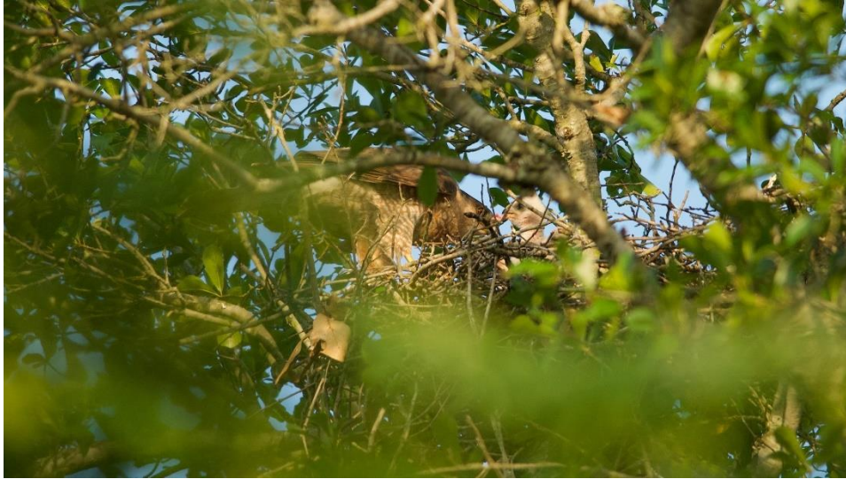
Cooper's Hawk, 22 May 2020, Brazos County

Cooper's Hawk – A pair of Cooper's Hawks again nested at Wolf Creek Park, Brazos . An adult brought food to a nestling 20-22 May (ph. Neil Diaz).