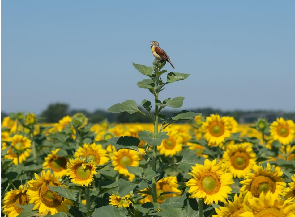
Dickcissel, 27 May 2020, Brazos County