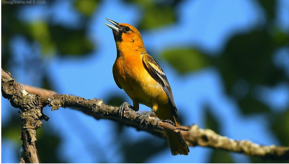
Bullock's Oriole, 3 May 2020, Bell County