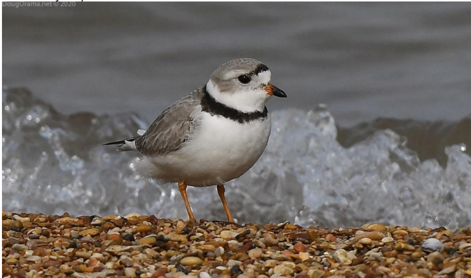
Piping Plover, 25 Apr 2020, Bell County